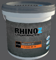
RF-135 RHINOZ Acrylic Skim 135

Packing : 4.5 kg Coverage : 20-24 m/4.5 kg set (Dimension 1x1 cm)