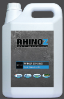
RF-143 RHINOZ Primer Bonding

A multipurpose acrylic latex bonding agent increases surface bond strength and flexural/tensile strength while reducing topping peeling, chalking, and shrinkage. It's easy to apply, dries fast with low odor, and is suitable for concrete, mortar, plaster, and both new/existing surfaces.