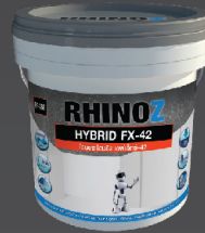
RF-288 RHINOZ Hybrid FX-42

Packing : 1 litre and 4 litre Coverage : 10-15 sqm/litre (Depending on surface)